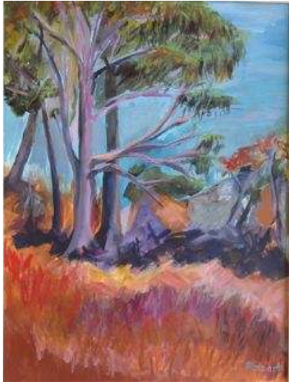
Pine Trees in a field at Barbeville in Provence