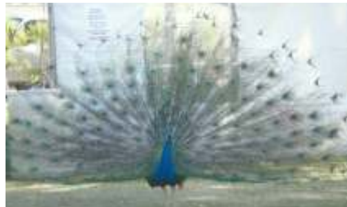
Even the Peacocks were happy to see the Burnett's