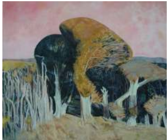
Yew in the Landscape

obtained a Diploma in Art and Design Textiles/Fashion and Rug Weaving. In 1968 she attended the Brighton College of Art and then taught Art full-time at school in East Sussex and ran a small gallery, drawing courses for adults and undertook various commissions. From 1972-1974 she was an art teacher in charge of an International School in Tehran and then lived and travelled in Bolivia before teaching in Kent until 1977 when she moved to Aberdeen helping a weaver friend to run a weaving workshop in Aberdeen, joined Grampian Guild of Spinners and Weavers. She exhibited Tapestry at Aberdeen Art Gallery to teach before moving back to Kent. In 2008 she gained a B.A.(hons) in Painting at the Gray's School of Art, Robert Gordon University, Aberdeen. Since returning to Scotland after bring up a family, she has exhibited in various galleries and have shown work in group exhibitions, including Aberdeen Artists' Society