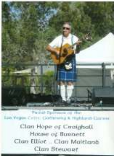
They were glad to see the House of Burnett