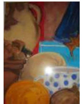
The Dotty Mug