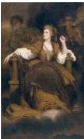
Mrs Siddons as the Tragic Muse

The portrait below of Mrs Siddons was painted by Sir Joshua Reynolds in 1784 and he signed it on the hem of her dress, "for" he told her, "I have resolved to go down to posterity on the hem of your garment."