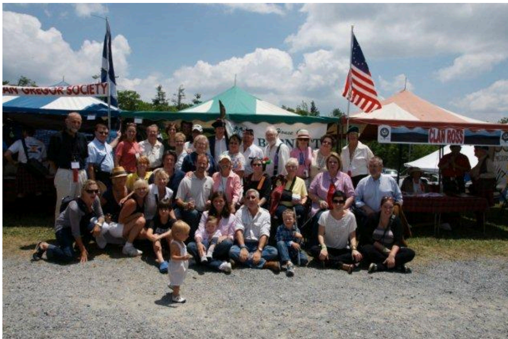
This is a handful of the Burnett's that we met at the games. Picture was taken after our Board of Directors picnic.

Parting on Sunday from our newly formed friendships and family bonding was difficult, but promises were made to keep in touch with each other and, hopefully, try to do it all over again next July.