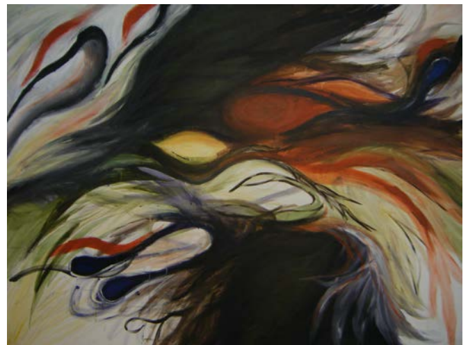
Hokkaido- Acrylic and graphite on canvas 2008