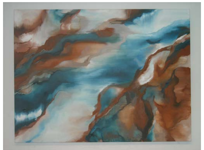
Firmament - Oil on canvas 2010