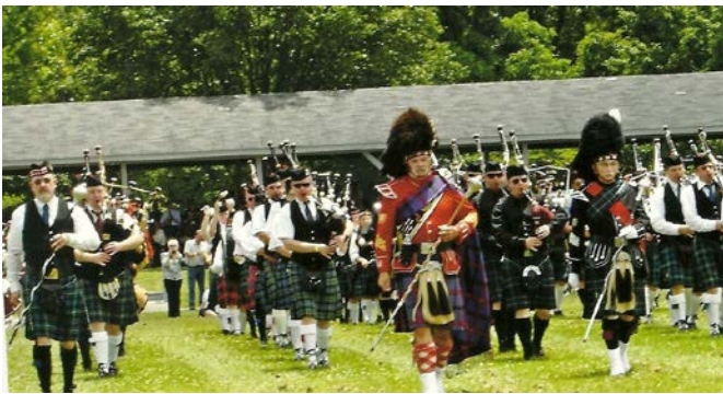
The Mass Bands putting on a Great show!