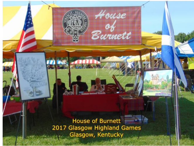
House of Burnett 2017 Glasgow Highland Games Glasgow, Kentucky