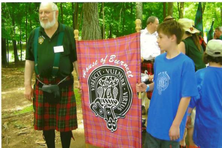
The House of Burnett Clan lining up and marching in the parade of tartans