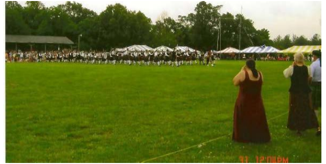
The Pipe Band entertaining the crowd!