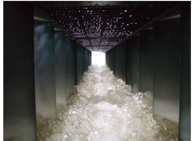
Interior of Fish Pass