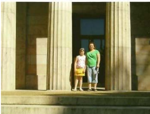
Burnett Clan visiting the birthplace of Abraham Lincoln in Hodgenville, KY