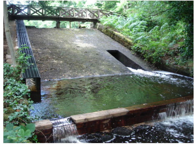
Dam on Fish Pass