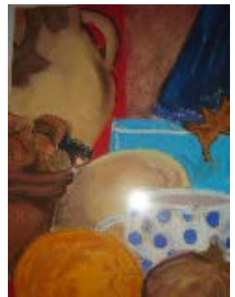
The Dotty Mug