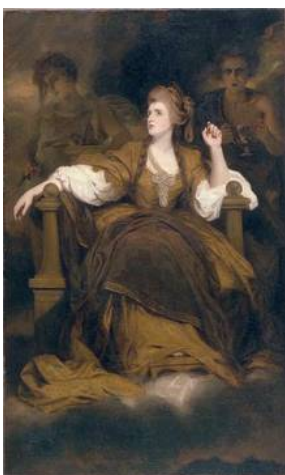
Mrs Siddons as the Tragic Muse

The portrait below of Mrs Siddons was painted by Sir Joshua Reynolds in 1784 and he signed it on the hem of her dress, "for" he told her, "I have resolved to go down to posterity on the hem of your garment."